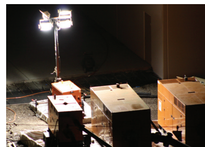
Diesel, Electric & Battery Powered Light Towers